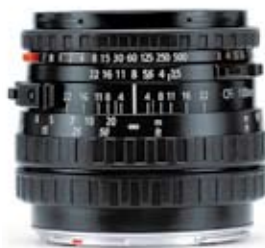
CFi 3.5/100 mm